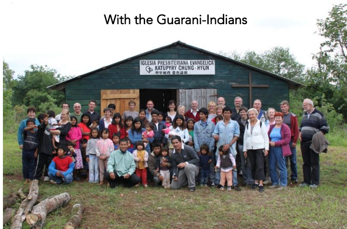
With the Guarani-Indians