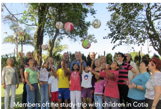
Members of the study-trip with children in Cotia

2. Study-trip – in the first part of the trip, from October 4 th to the 12 th , we traveled together with a study-trip group. This was a great blessing. I visited, together with this group, projects around Sao Paolo (orphanage in Cotia and social center in Diadema), as well as some projects in northern Argentina, for example the church