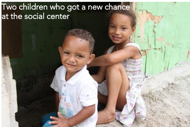
Two children who got a new chance at the social center