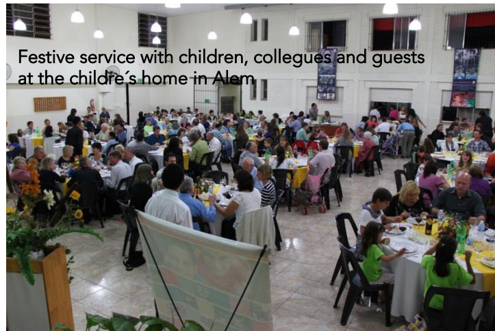
Festive service with children, colleagues and guests at the childre's home in Alem

✓ Children's home "Norberto Haase" – A very important moment here was a festive service, with a followed dinner. People that participated in this event were the children, colleagues, the board of directors of the children's home, many people from the churches in the area, as well as invited guests from politics and the economy.